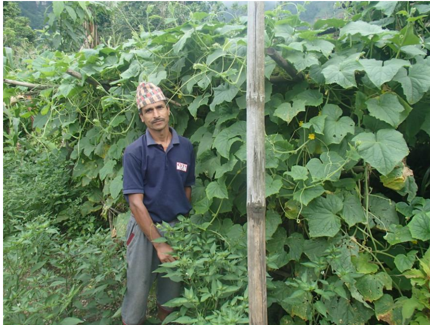
Chilaunekharka village, NP-23 , Syangja.

NP-23 CHILAUNEKHARAK DADRA GANDAKI PROVINCE - SYANGJA NEPAL