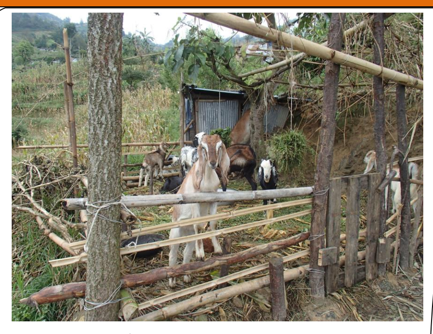
Goat of Setimaya Chittegaun Nagarkot Kavre

NP - 52 CHITTEGAUN BAGMATI PROVINCE - KAVRE NEPAL