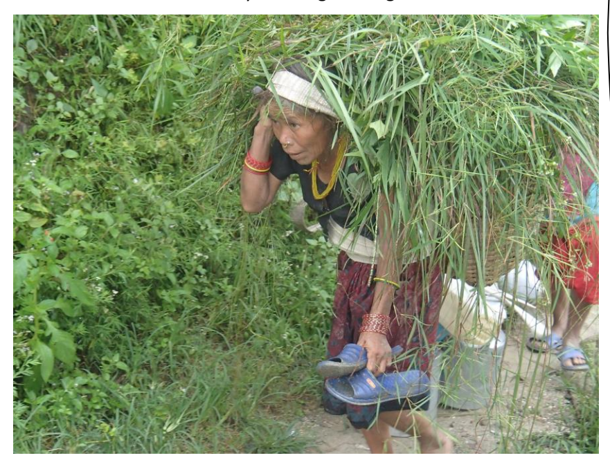
Setimaya is collecting grass for goats

ANNUAL PROGRESS REPORT FISCAL YEAR 2076-077/JULY 2019 TO JUNE 2020